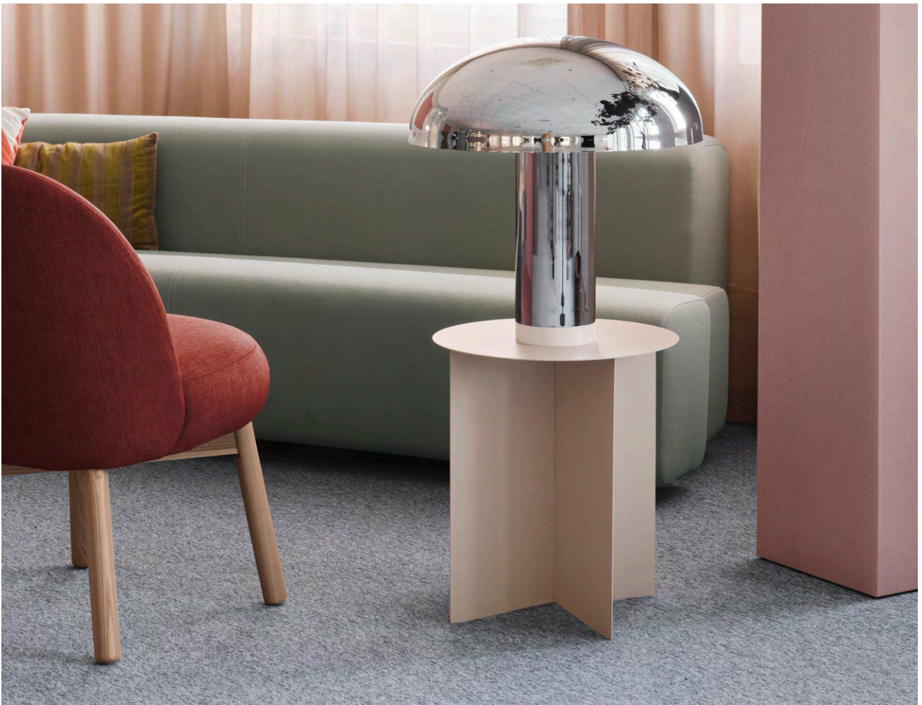
Project: Preem

On the following pages, you will find more detailed information regarding the care, cleaning and maintenance of textile flooring. Please feel free to contact us if you have any questions or require further guidance.